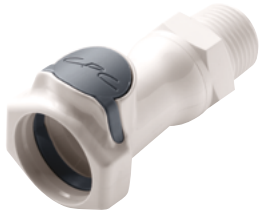
Tapered pipe male thread

FFC quick couplings are widely used in cooling circuits and mobile devices with water supply connections.