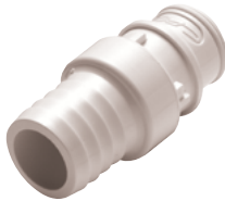
In-line straight barb