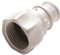
Parallel pipe female thread