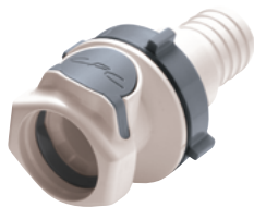
Shut-off coupling straight barb