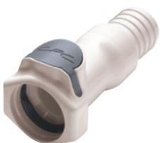
In-line straight barb