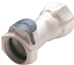
Parallel pipe female thread