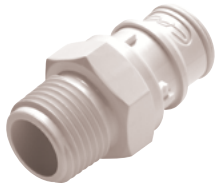
Tapered pipe male thread