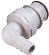
Elbow straight barb