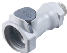
Tapered male thread

couplings are recommended for all applications with water, acids, alkaline substances and most other chemicals.