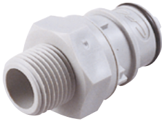
Tapered pipe male thread