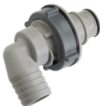
New Elbow with Panel mount straight barb