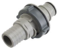
New Panel mount straight barb