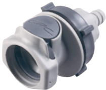
Shut-off coupling straight barb