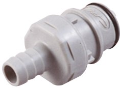
In-line straight barb