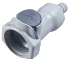
In-line straight barb