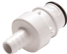
In-line straight barb