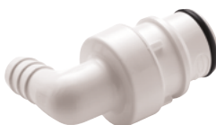
Elbow straight barb