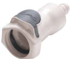
In-line straight barb