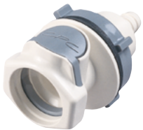
Shut-off coupling straight barb