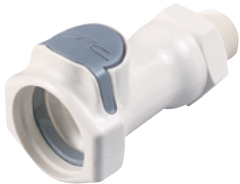
Tapered pipe male thread

HFC35 series nominal diameter 9.6 mm, polysulfone