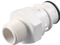
Tapered pipe male thread