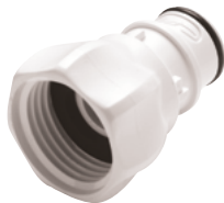
Parallel pipe female thread