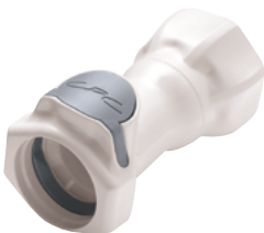
Parallel pipe female thread