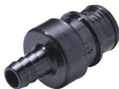
In-line straight barb