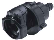
Shut-off coupling straight barb