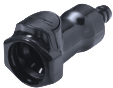
In-line straight barb