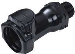
Tapered pipe male thread

HFC57 series nominal diameter 9.6 mm, polysulfone, UV-resistant