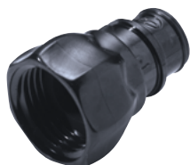
Parallel pipe female thread