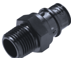
Tapered pipe male thread