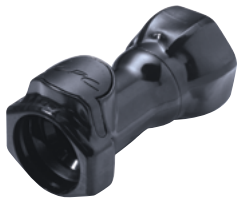
Parallel pipe female thread