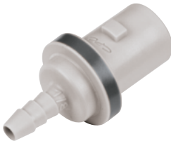
In-line straight barb

* observe inner and outer tube diameters!