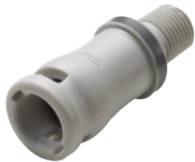
Tapered pipe thread

applications with electronic components in the flow path. NS2 coupling bodies and plugs are made from glass-filled polypropylene with EPDM sealing elements and stainless steel springs.