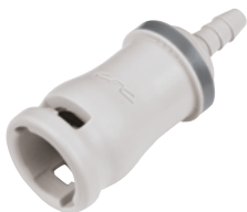
In-line straight barb

* observe inner and outer tube diameters!