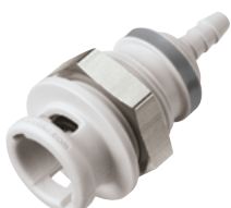
Panel mount straight barb

* observe inner and outer tube diameters!