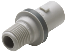
Tapered pipe thread