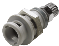
Panel mount PTF Polytube fitting, ferruleless*