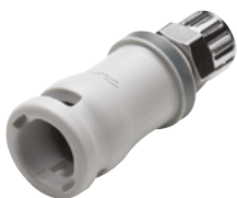
In-line PTF Polytube fitting, ferruleless*