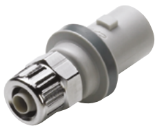
In-line PTF Polytube fitting, ferruleless*