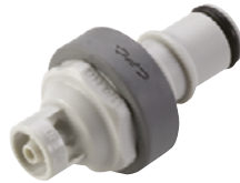
In-line straight barb

* observe inner and outer tube diameters!