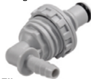
Elbow Panel mount straight barb