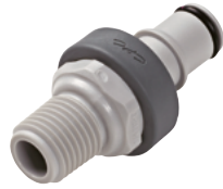
Tapered pipe thread