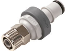
In-line PTFE Polytube fitting, ferruleless*