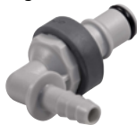
Elbow straight barb