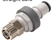
Panel mount PTFE Polytube fitting, ferruleless*