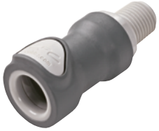
Tapered pipe thread

flow path. NS4 coupling bodies and plugs are made from glass-filled polypropylene with EPDM O-rings and stainless steel springs.