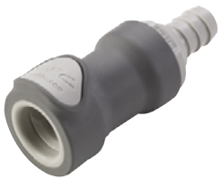
In-line straight barb

* observe inner and outer tube diameters!