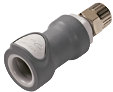
In-line PTFE Polytube fitting, ferruleless*