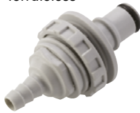
Panel mount straight barb

* observe inner and outer tube diameters!