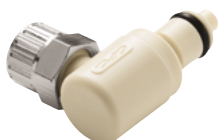
Elbow PTF Polytube fitting, ferruleless*