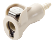
In-line straight barb

* observe inner and outer tube diameters!