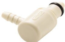
Elbow straight barb

* observe inner and outer tube diameters!