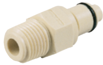
Tapered pipe thread

PMC12 series nominal diameter 3.2 mm, polypropylene