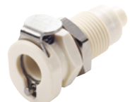
Panel mount straight barb

* observe inner and outer tube diameters!