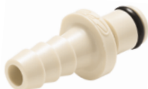
In-line straight barb