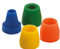
1/4 - 28 inserts