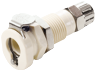
Panel mount PTF Polytube fitting, ferruleless*