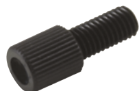
1/4 - 28 nut