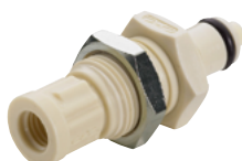
Panel mount Inline 1/4-28 female thread