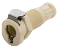
Panel mount 1/4 - 28 female thread