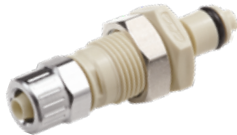
Panel mount PTF Polytube fitting, Ferruleless*