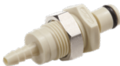
Panel mount Straight barb

* observe inner and outer tube diameters!