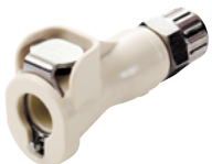
In-line PTF Polytube fitting, ferruleless*