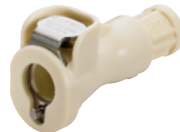
InLine 1/4 - 28 female thread