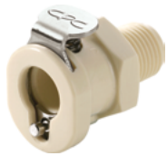
Tapered pipe thread

PMC12 series nominal diameter 3.2 mm, polypropylene