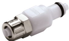
In-line PTF Polytube fitting, ferruleless*