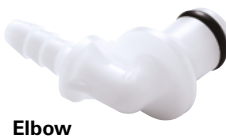
Elbow straight barb

* observe inner and outer tube diameters!