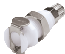
Panel mount PTF Polytube fitting, ferruleless*