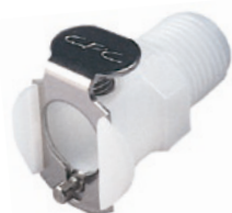
Tapered pipe thread

for use with most mild chemicals. The PMC12 is made in polypropylene and is resistant to a wide range of chemicals.