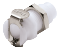
Panel mount Female thread