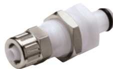
Panel mount PTF Polytube fitting, ferruleless*