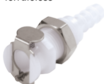
Panel mount straight barb

* observe inner and outer tube diameters!