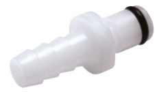
In-line straight barb

* observe inner and outer tube diameters!