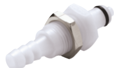
Panel mount straight barb

* observe inner and outer tube diameters!