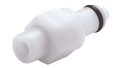
In-line female thread