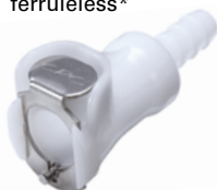
In-line straight barb

* observe inner and outer tube diameters!