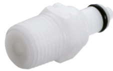
Tapered pipe thread