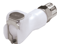
In-line PTF Polytube fitting, ferruleless*