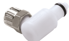
Elbow PTF Polytube fitting, ferruleless*