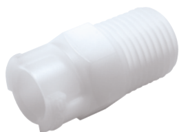
Tapered pipe thread

allows tubes to rotate freely when connected, preventing both kinking and accidental disconnection during use.