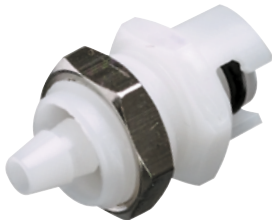
Panel mount straight barb