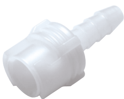
In-line straight barb