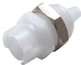
Panel mount straight barb