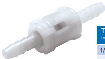
Two-sided straight barb